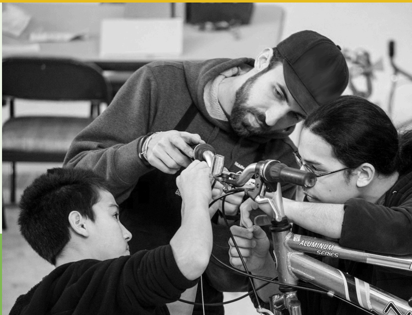
MENTORING STUDENTS THROUGH OUR PROGRAMS