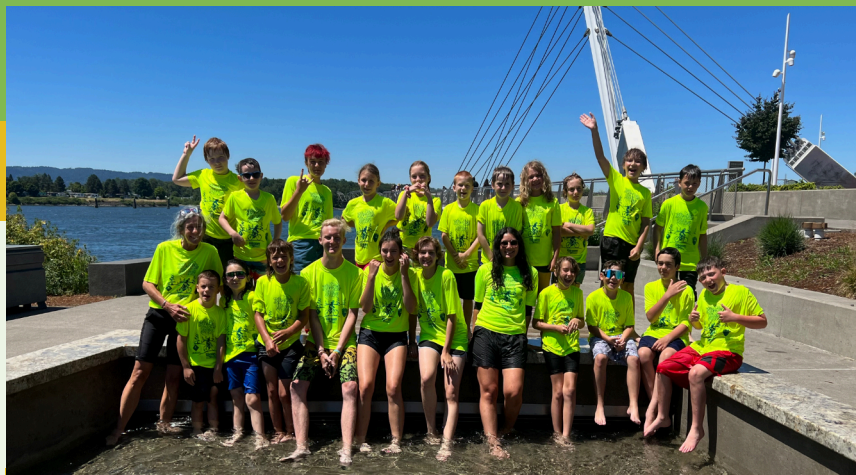
SUMMER CAMP STUDENTS ON THE WATERFRONT

The generosity of our community makes this work possible — here's how you can help!